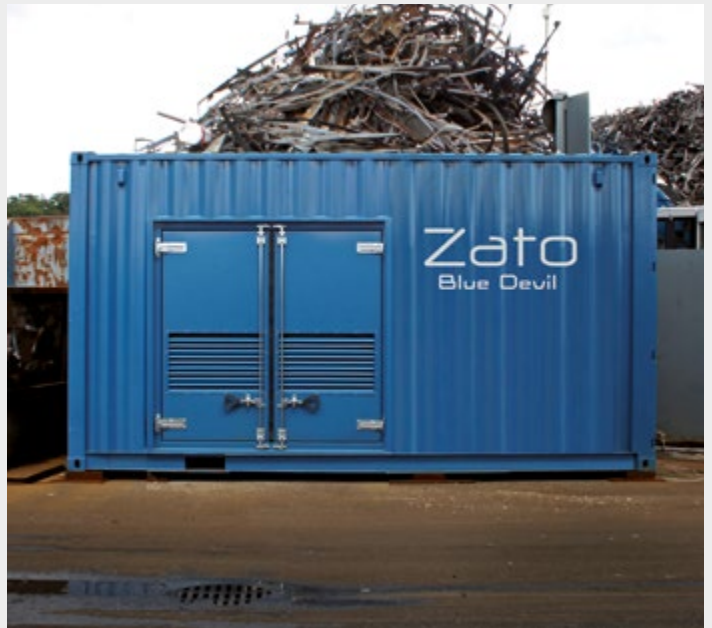
CONTAINER 40" mm. 12.120 X 2.450 X 2800 (MOTORE ELETTRICO CON INVERTER).

Service door with panic exit bar, main door. Internal lighting.